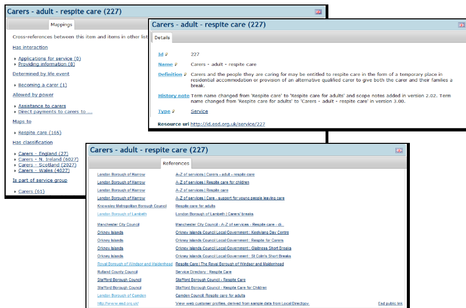
Figure 1 Example service.

A service has a unique identifier, a name and a definition. It is cross referenced with other definitions and with information pertaining to the service.